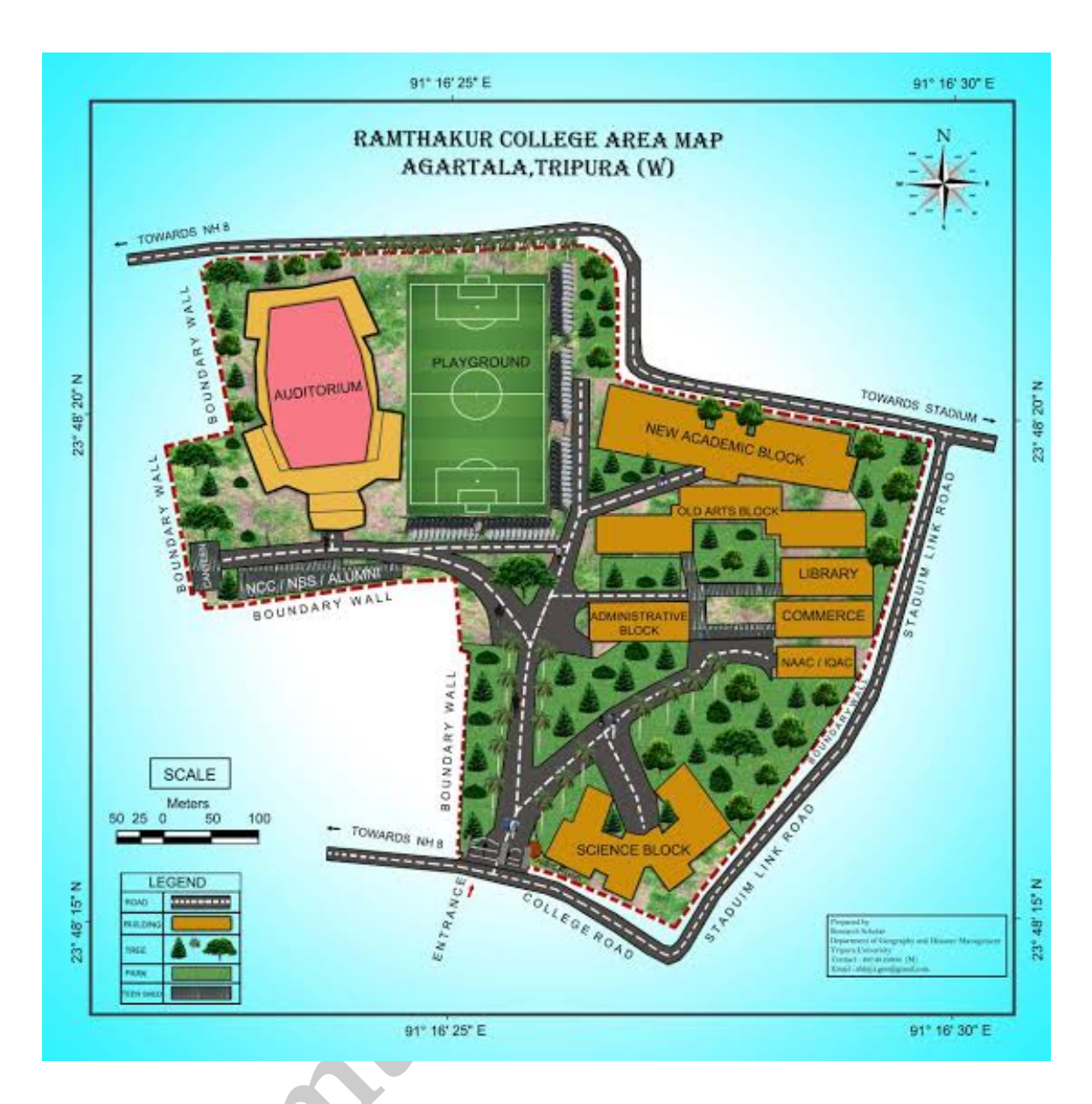
Area map of Ramthakur College